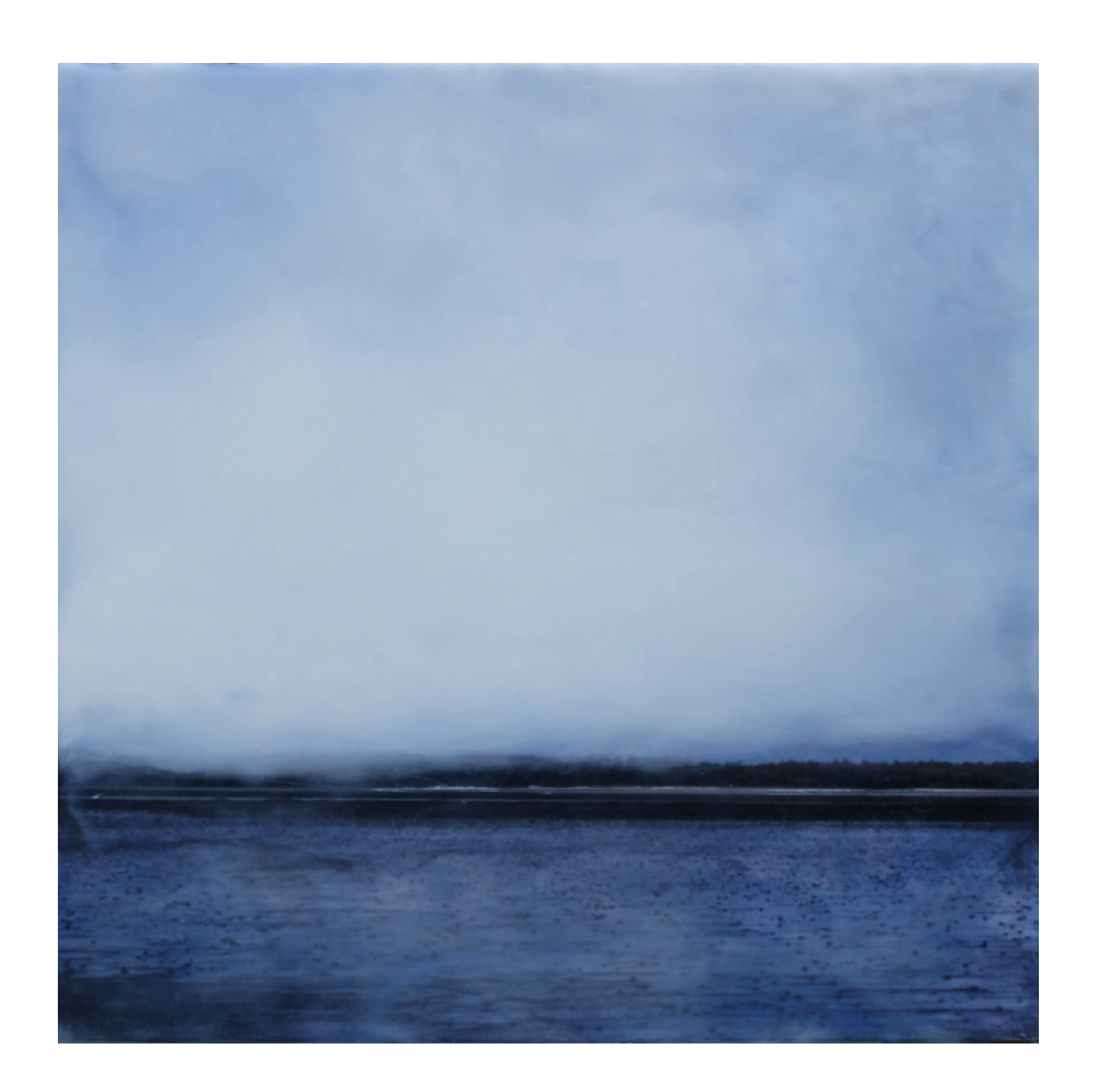
Blavand beeswax, resin and pigment on photo on panel 30cm x 30cm