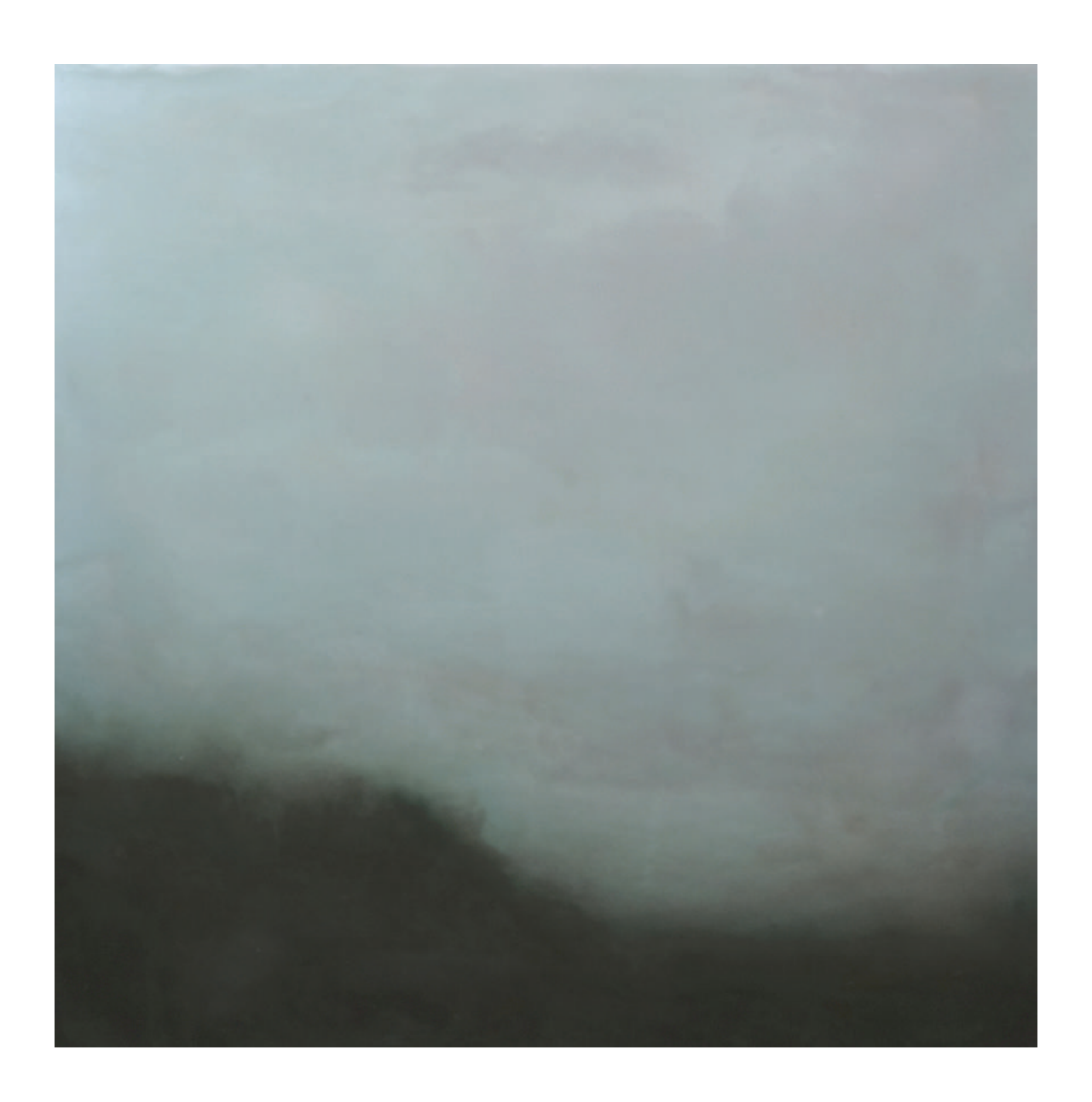
Chamonix beeswax, resin and pigment on photo on panel 30cm x 30cm