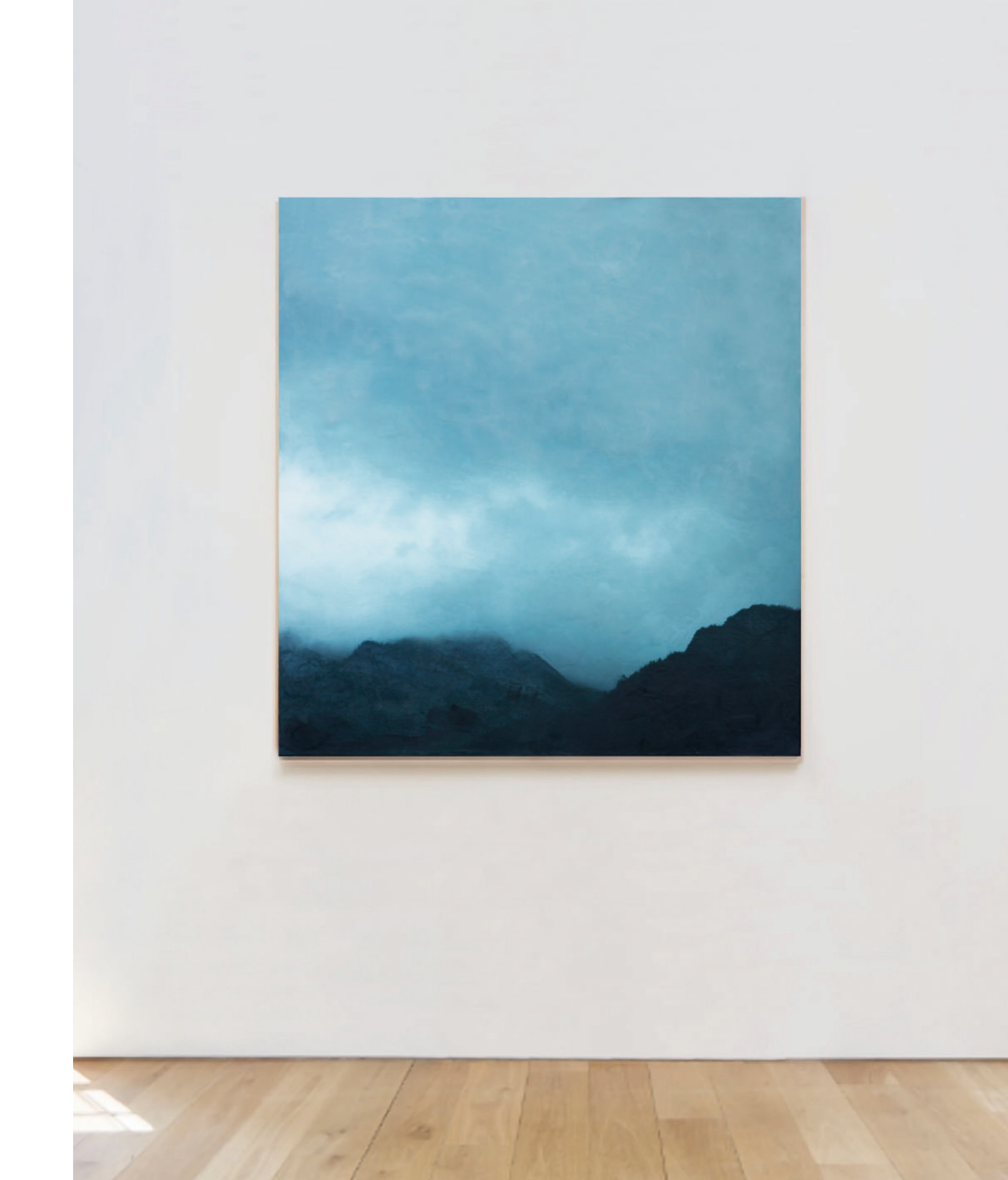
Chamonix Soir beeswax, resin and pigment on photo on panel 110cm x 100cm