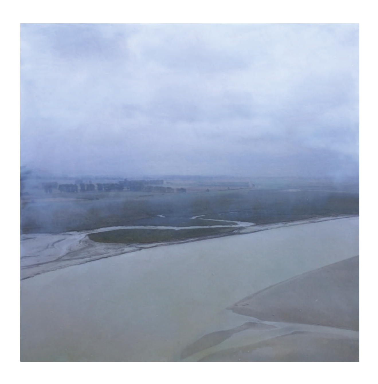
Morning Mont St Michel beeswax, resin and pigment on photo on panel 60cm x 60cm