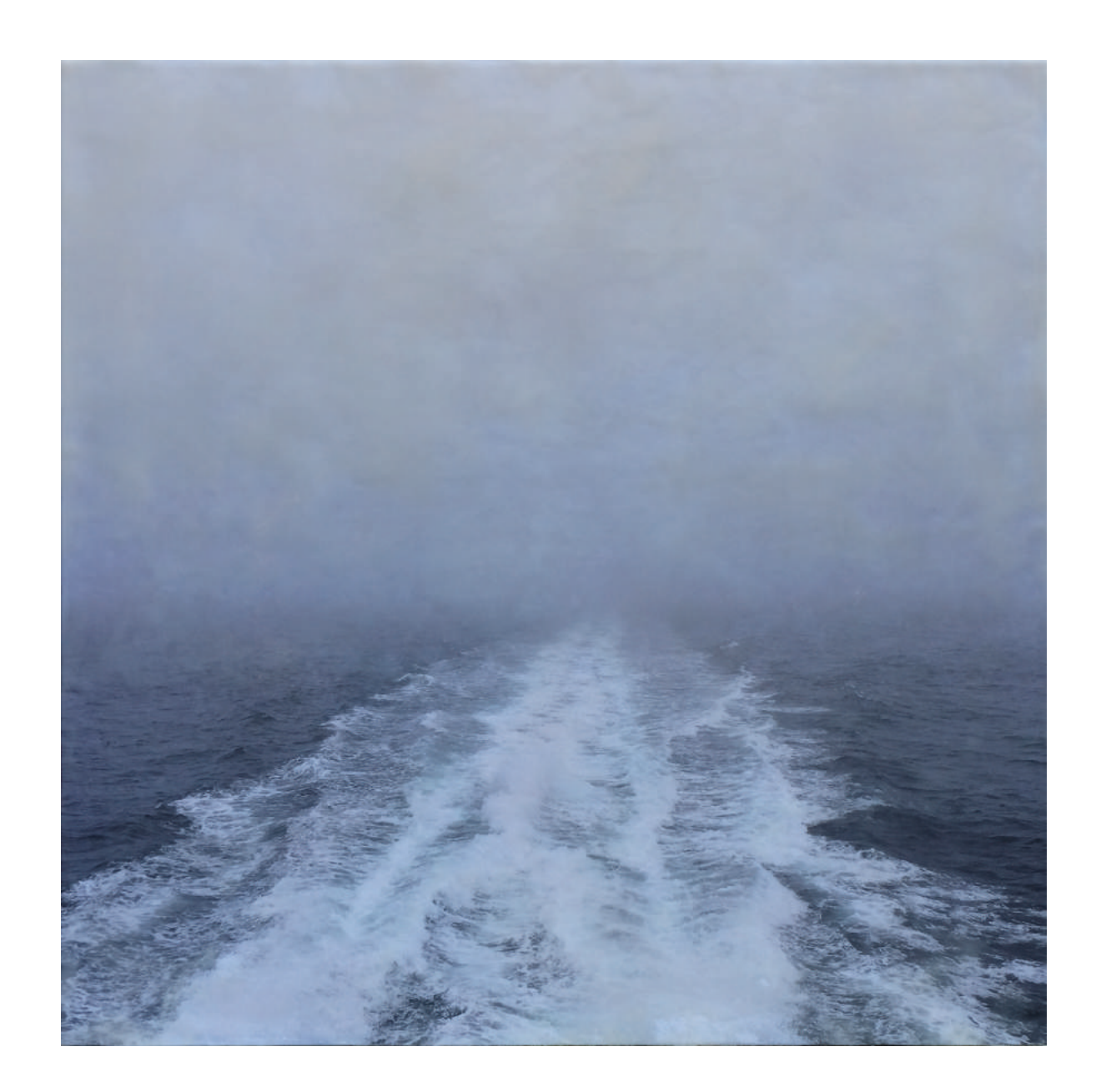
The Other Shore beeswax, resin and pigment on photo on panel 60cm x 60cm