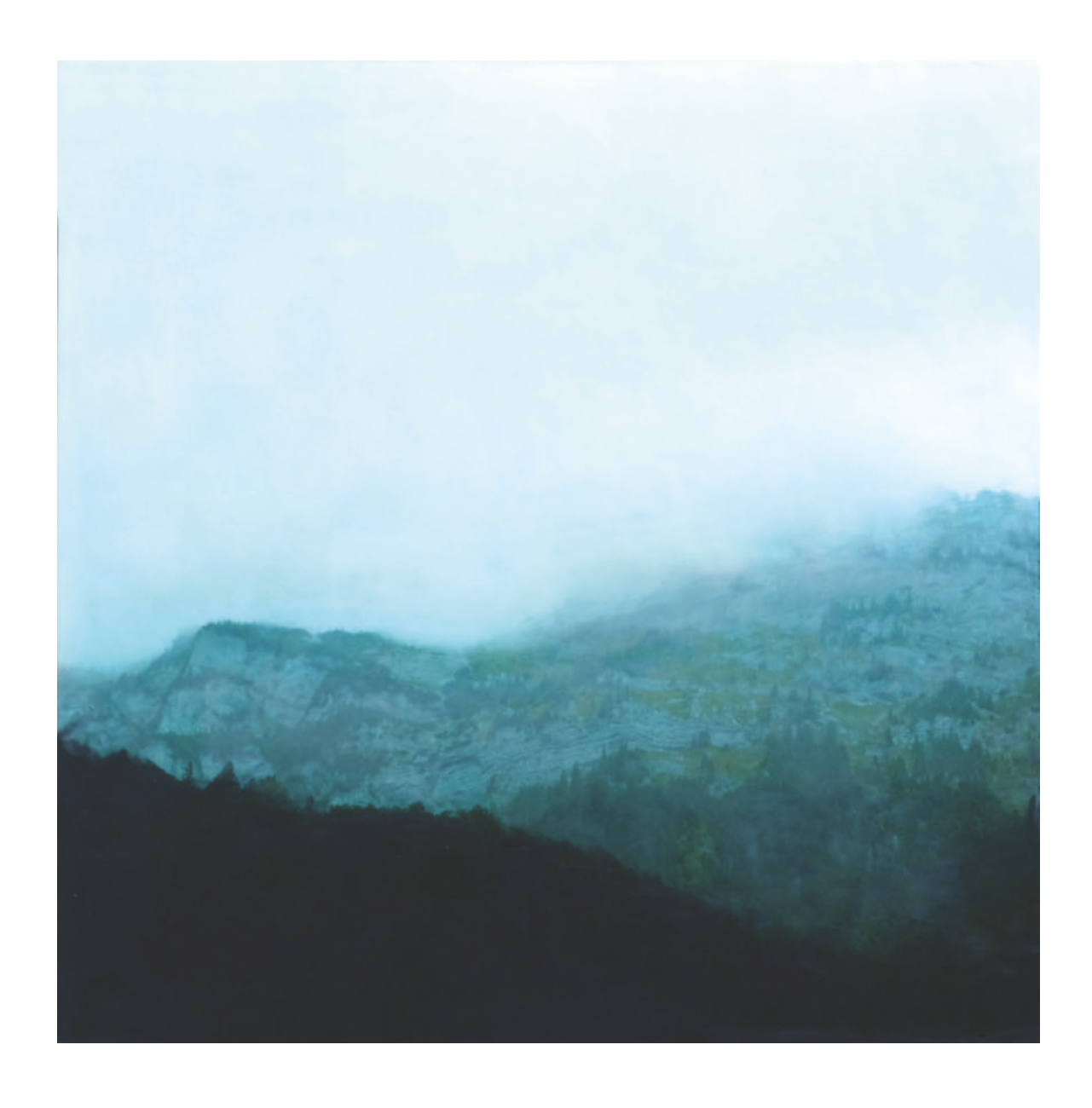
Lucerne beeswax, resin and pigment on photo on panel 60cm x 60cm