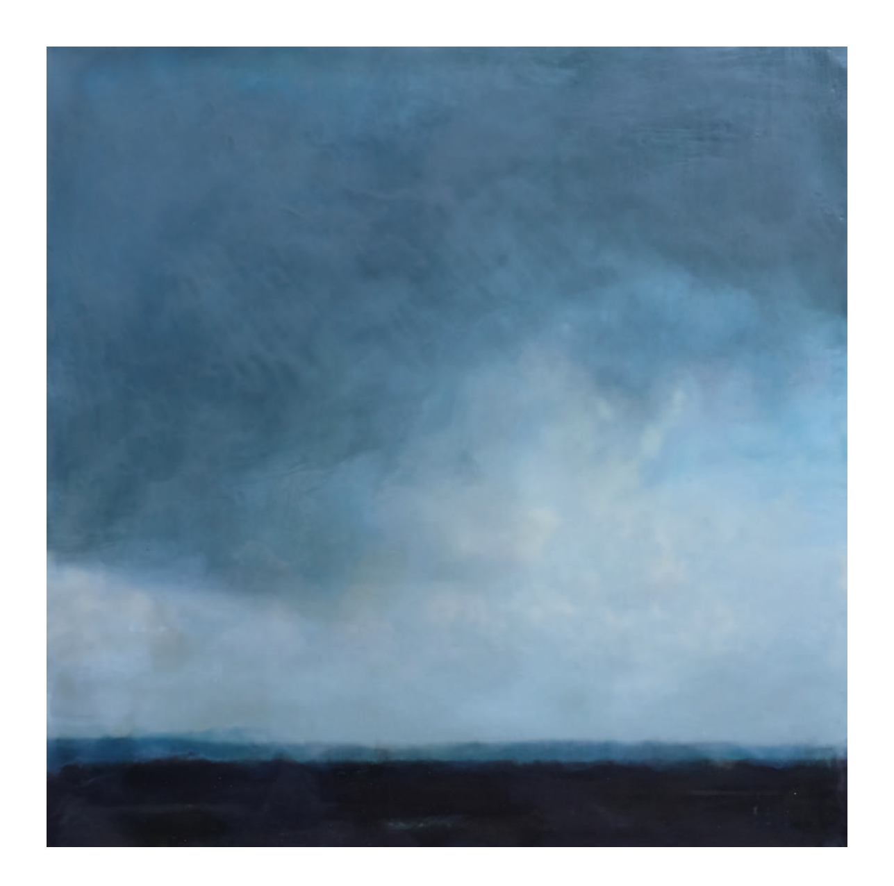
The Lowlands beeswax, resin and pigment on photo on panel 40cm x 40cm