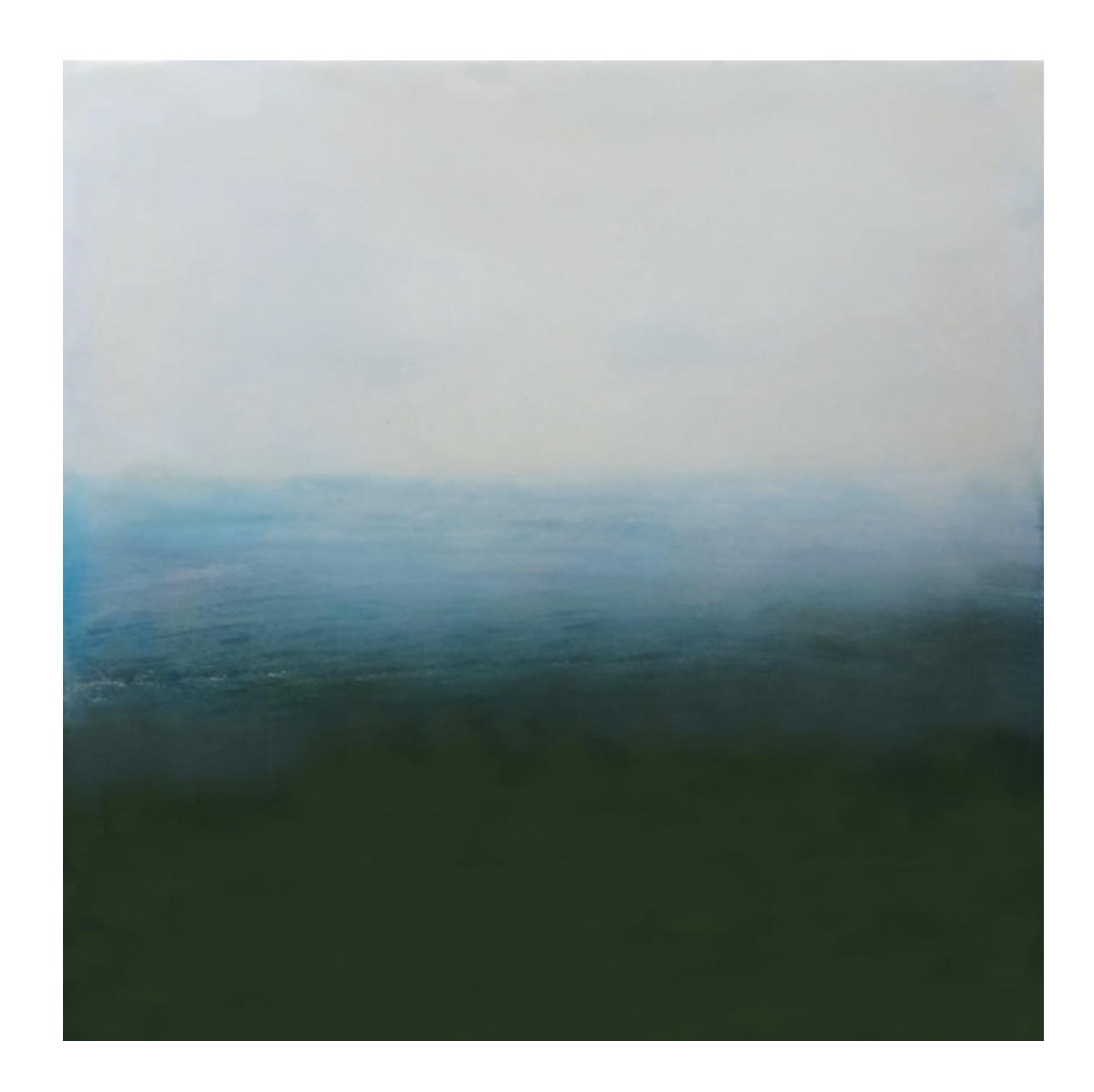
Leaving Montreal beeswax, resin and pigment on photo on panel 30cm x 30cm