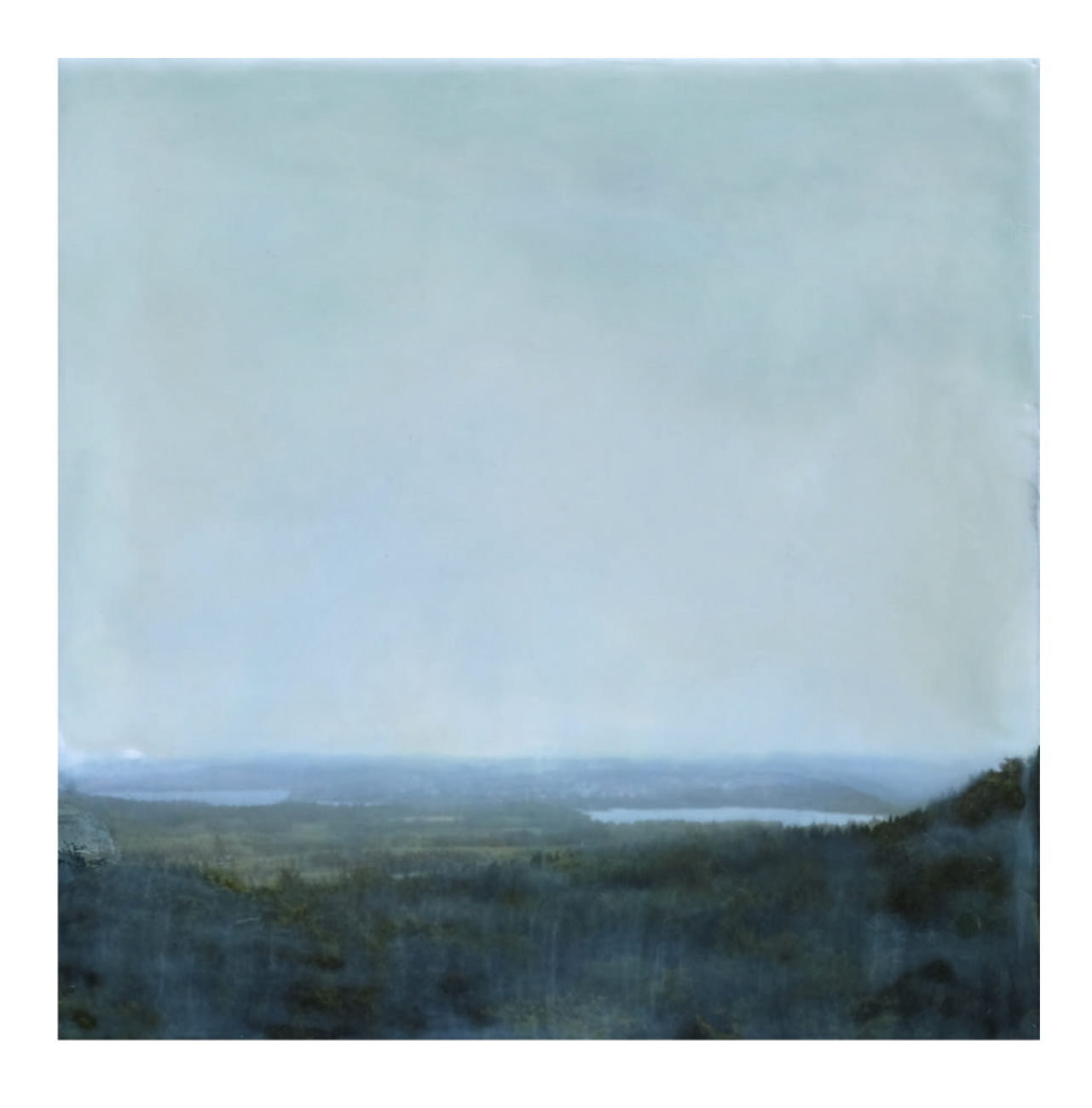
Silkeborg beeswax, resin and pigment on photo on panel 40cm x 40cm